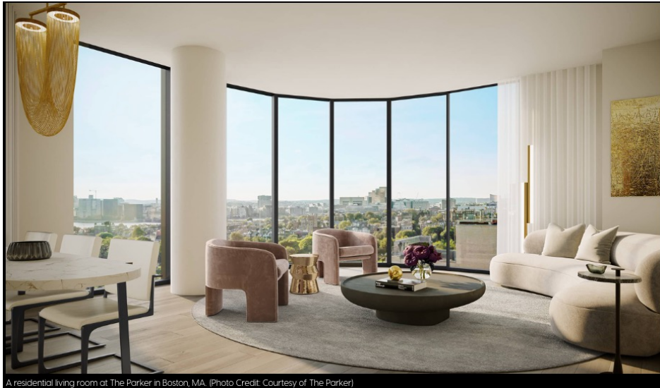
A residential living room at The Parker in Boston, MA.