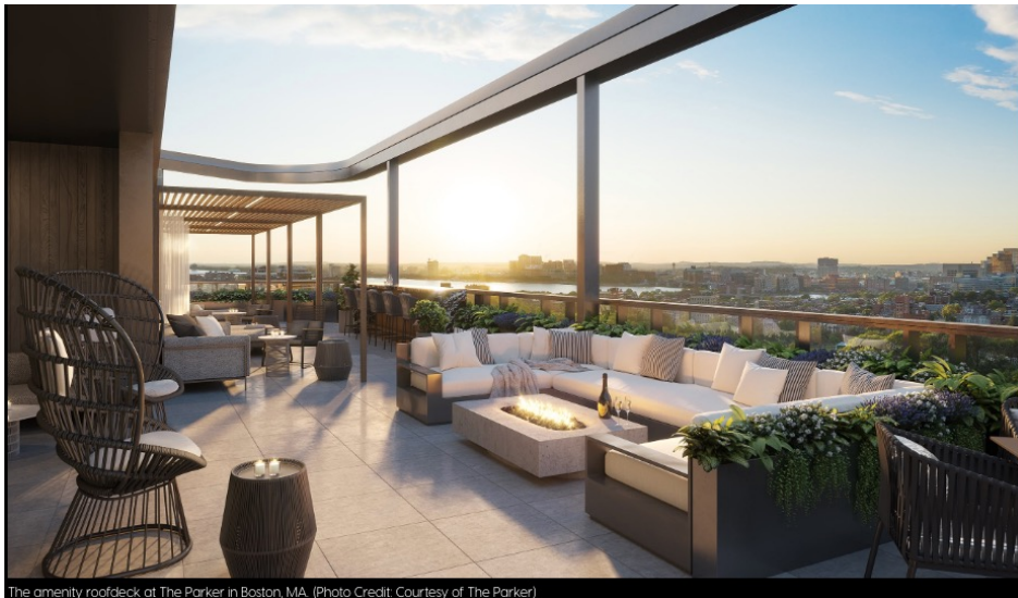
The amenity rooftop at The Parker in Boston, MA.