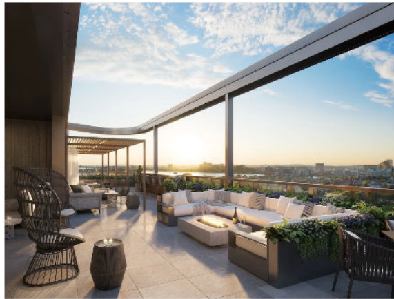
Amenities include a sky lounge roof deck

The overall aesthetic is subtle, and yet unmistakable, in its grandeur. Big accents of gold and glitz would be considerably gauche for the Athens of America; instead, The Parker reflects the nature of the cultural capital of the East Coast with a brown and cream palette that highlights the breathtaking of the city outside.