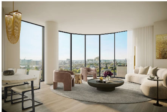
Floor-to-ceiling windows boasting gorgeous vistas of Boston

This is something The Parker's Penthouse 21B capitalizes on, to great success. Gorgeous floor-to-ceiling windows showcase Boston at its finest. Expect wondrous vistas of the old Back Bay neighborhood, which dates back to the early 19 th century, and direct views of the John Hancock building, the tallest skyscraper in New England.