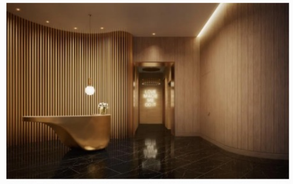
The lobby. THE PARKER

The most expensive condo sale was actually two purchases in one. The buyer purchased two twobedroom penthouses and combined them for a total of 2,486 square feet. Residences are designed by Linda Zarifi of Zarifi Design and features include nine-foot ceilings; floor-to-ceiling windows; five-inchwide oak flooring; Italian marble backsplashes and quartz countertops; pendant lighting; and state-ofthe-art appliances. There are panoramic views over Boston Common and the rest of the growing city.