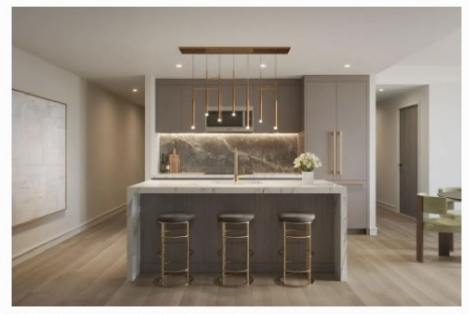
The kitchen in the penthouse. THE PARKER

Gronk Fitness is an online retail store that carries the top brands in fitness equipment. The sleek gym features cardio equipment like treadmill and bikes, plenty of space to train, chic overhead lighting, and every piece of equipment you could possibly need to work on your fitness. This includes weight racks, cardio machines, dumbbells, benches, resistance bands, and so much more. The Gronkowski family has built out more than 1,500 gyms around the country since 1990.