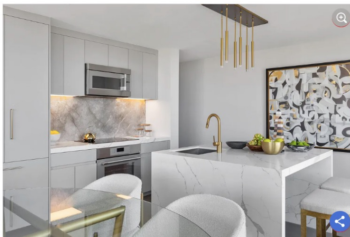
The kitchen features brass finishes and quartz counters.