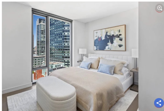
One of the two bedrooms.