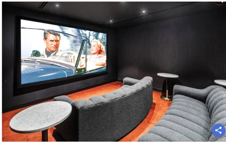
The Velvet Room.