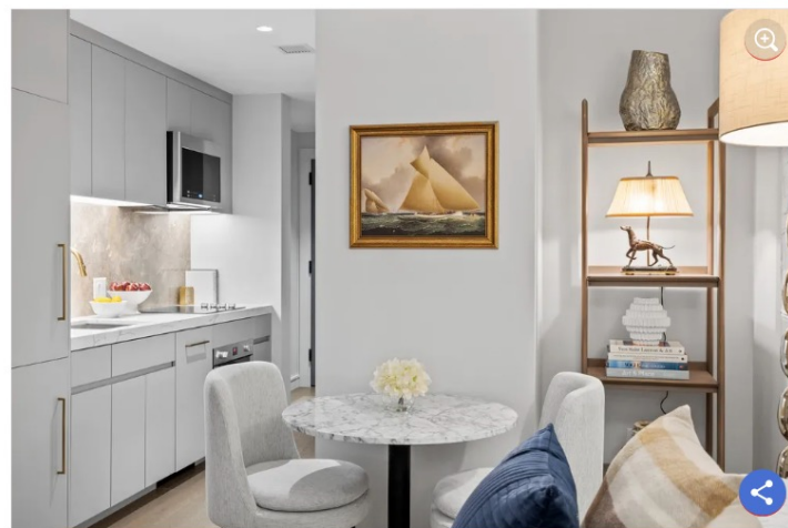
Studios start at $600,000.