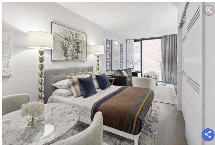
A studio condo.