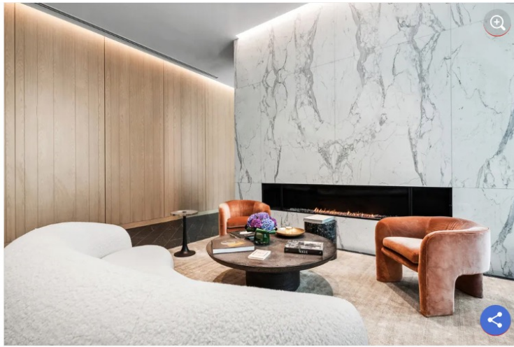
The lobby lounge at The Parker.