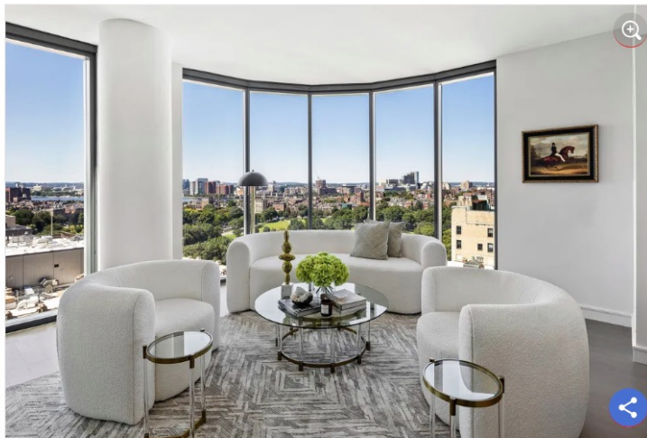
The living room of a soon-to-be-listed $2.8 million penthouse with panoramic city views.