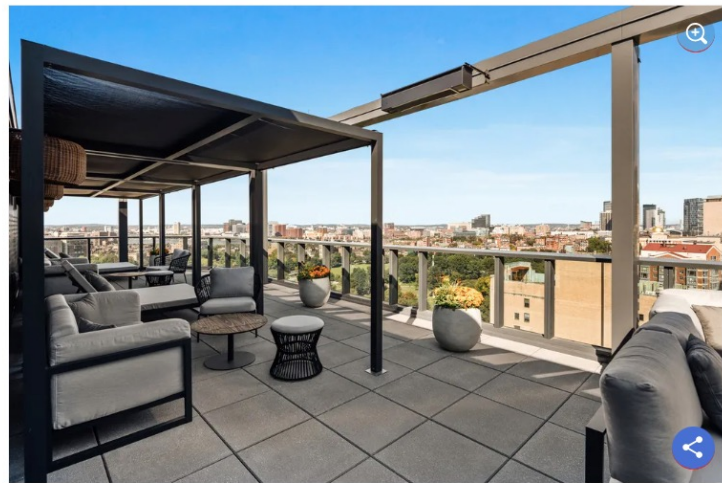
The Vue roof deck.