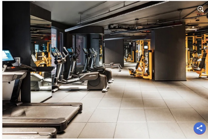
The Sculpt Fitness Center features workout equipment from Gronk Fitness.