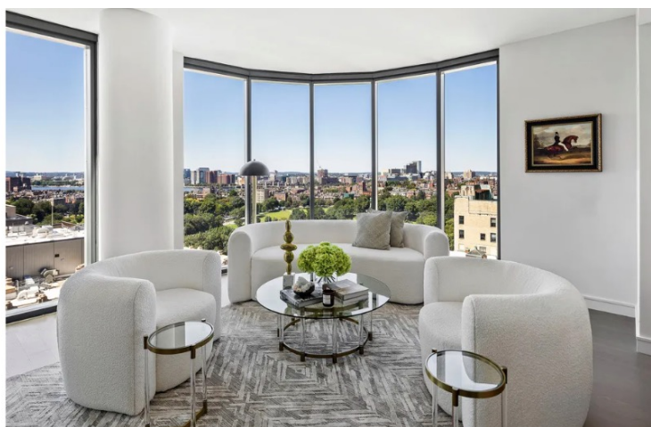
A sneak peek of a fully-furnished, not-yet-listed penthouse at The Parker in Boston.