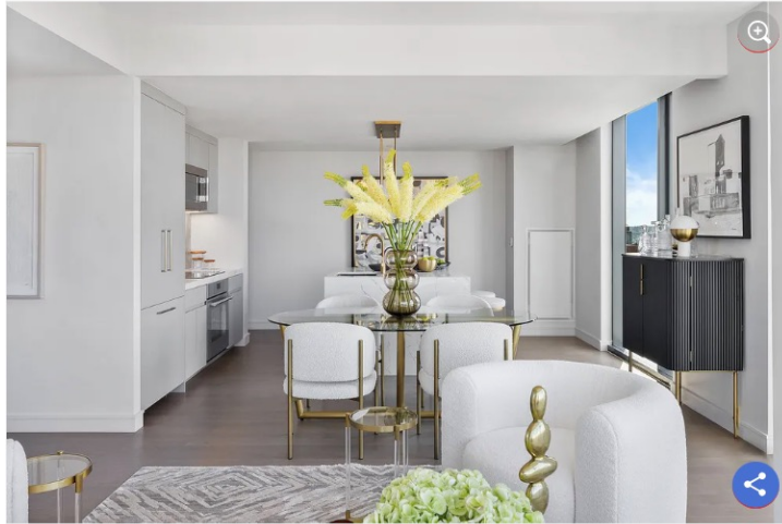
The penthouse has two bedrooms and two bathrooms.