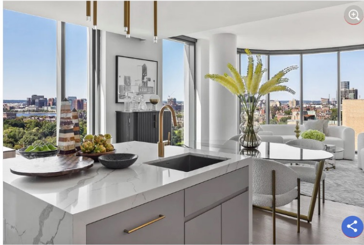
It measures 1,268 square feet.