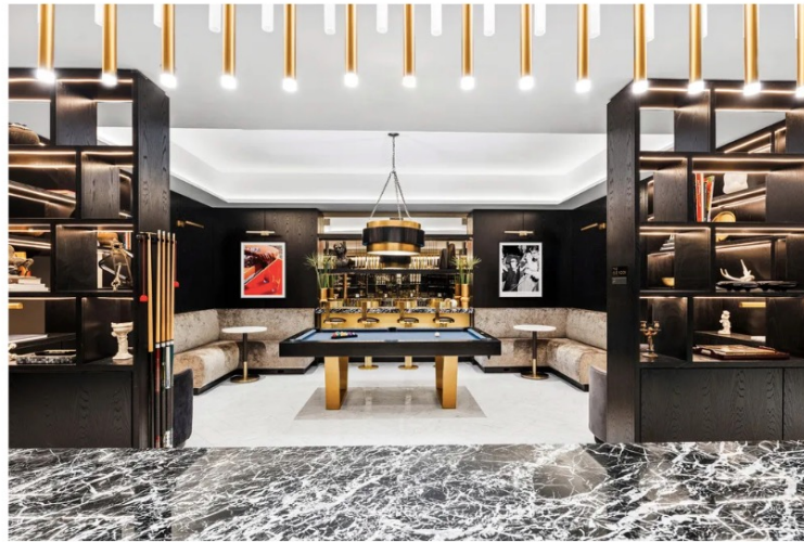
The 22-story building's three floors of amenity spaces include the Cue Room.

Residents of The Parker will have access to a whopping three floors of amenities, including the first-ever standalone condo gym designed by Gronk Fitness, former NFL star Rob Gronkowski's family's line of high-end fitness equipment. Naturally, the 1,300-square-foot complex was modeled after professional training facilities and takes cues from NCAA Division I athletic centers.