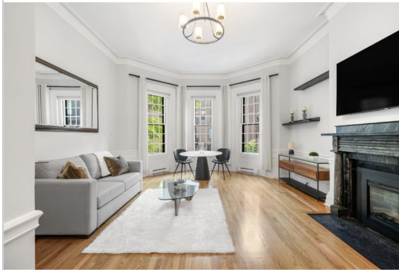
The recently renovated condo has large bay windows, a fireplace, high ceilings and hardwood floors