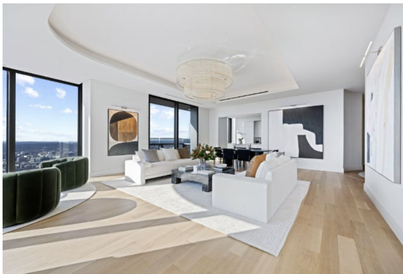
A two-bedroom home on the 57th floor of the Four Seasons One Dalton glass tower in Back Bay is on the market for $12.3 million with Zillow