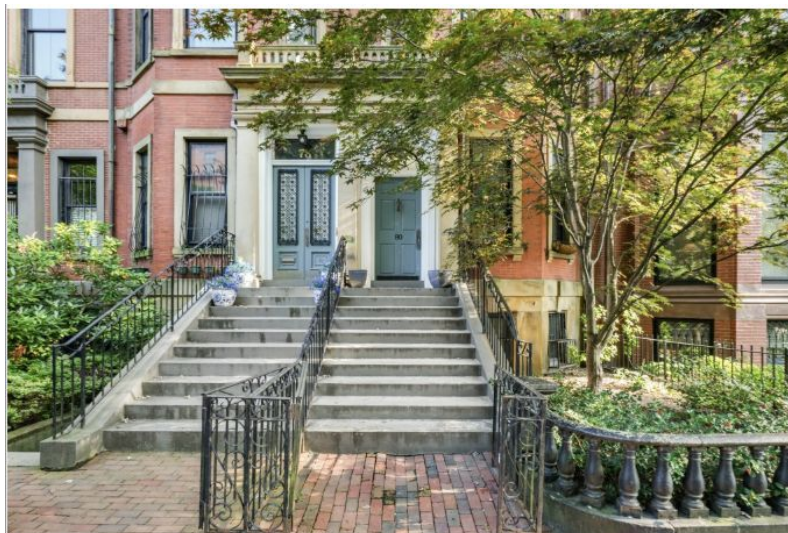
A one-bedroom condo on the tree-lined Marlborough Street in Back Bay is on the market for $1.165 million with Gibson Sotheby's