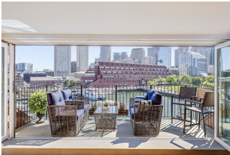
A two-bedroom penthouse with a balcony overlooking Boston Marina is on sale for $3.89 million with Gibson Sotheby's