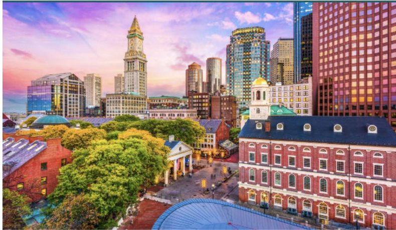
Downtown Boston, Massachusetts

Living in the 'Athens of America' comes at a premium price but its mix of old-world charm and cutting-edge tech holds strong appeal for British homebuyers